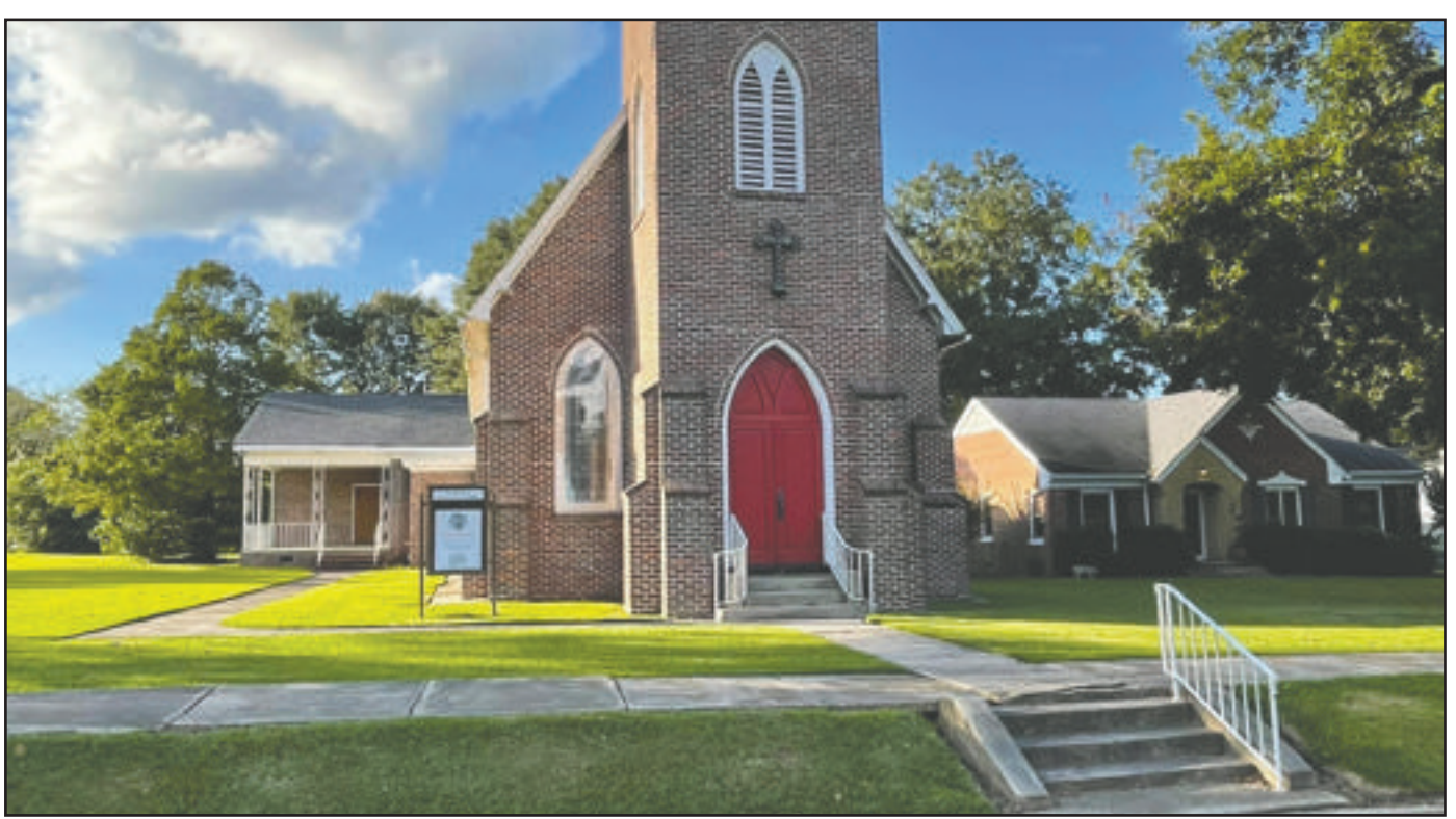
Special to Bolton News